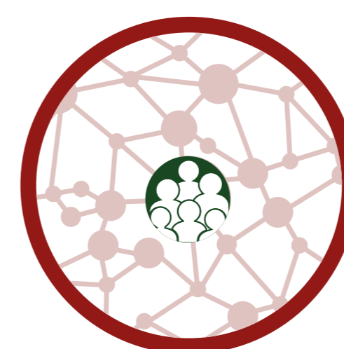
Accessibility & Social Inclusion